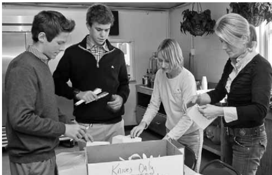
Confirmation students, parents and covenant partners served at Baldwin Center Soup Kitchen in November.